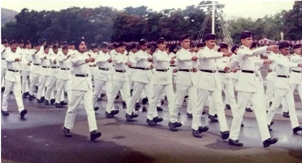
Passing Out Parade at the NDA, Khadakvasla, Pune