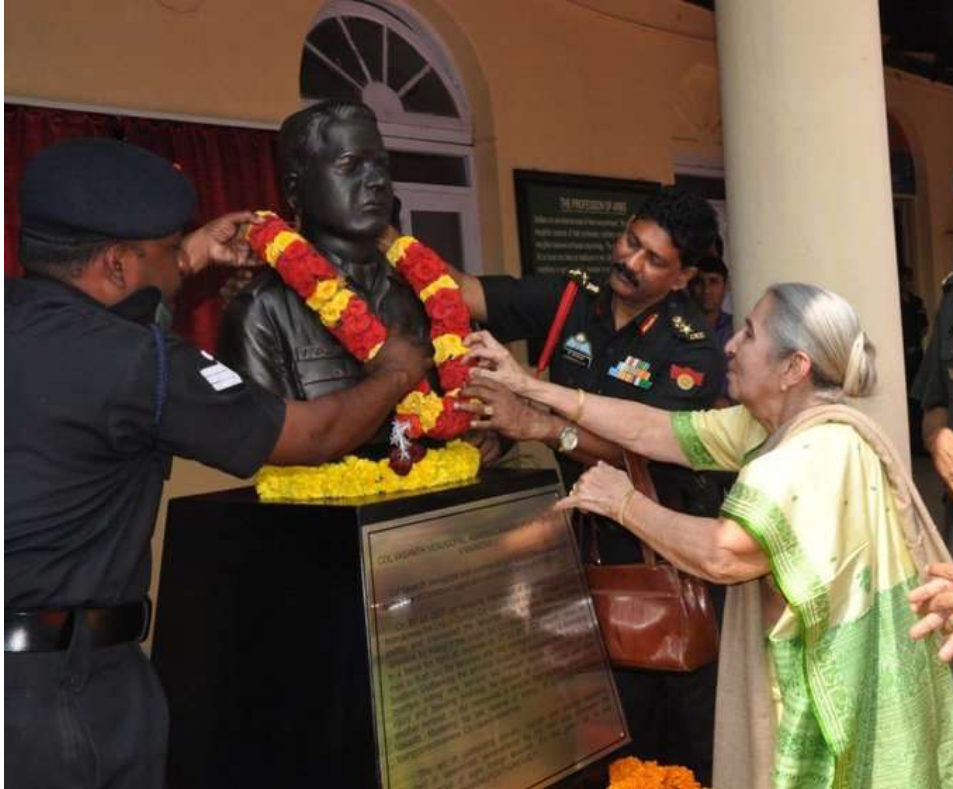
Mother Of Late Colonel Vasanth Venugopal Garlands the Statue of her son.