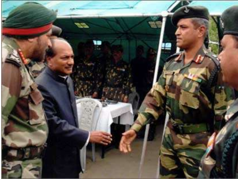
Col Vasant Venugopal, second from right, greets Defence Minister A K Antony

Unmindful of his injuries, he exhorted his men to block all escape routes and killed two more terrorists before succumbing to his wounds. A total of eight militants were killed in this operation by his troops.