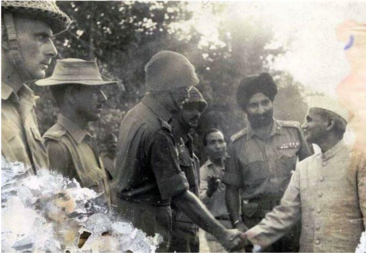
Prime Minister Lal Bahadur Shastri escorted by Brigadier Nirinjan Singh greets Lieutenant Colonel Desmond Hayde in Dograi.