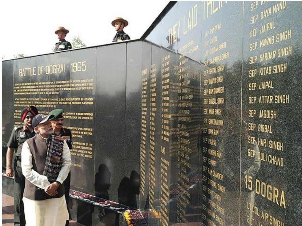
Prime Minister of India Shri Narendra Modi at the Dograi War Memorial Also seen in the photograph are the Army Chief General Dalbir Singh and the Western Army Commander Lieutenant General KJ Singh